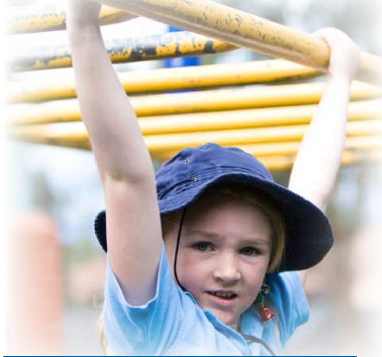
Map showing location of school

The school is also taking names and contact details of people who are interested in the child care program. These names will be passed on to the provider of the service once they are known.