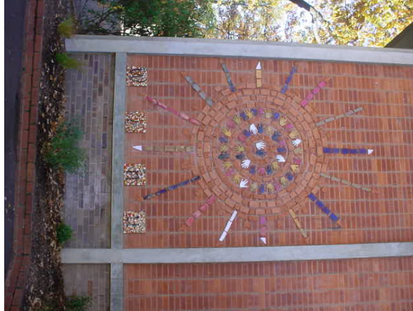
Students at Ainslie Primary School worked together to produce a wall mosaic

Programs and initiatives conducted over this reporting period include workshops for school staff on a cluster basis. Officers of the Department's Indigenous Education Section were involved either as participants or presenters in some of these workshops.