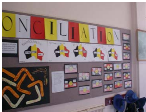
Art work produced by students at Ainslie Primary School

Twenty Indigenous students in Years 9 and 10 participated in a performing arts workshop coordinated by the Canberra Theatre and the Bangarra Dance Company. The program provided explanation of skills and movements in performing arts as well as opportunities for students to discuss their performing arts issues with performers