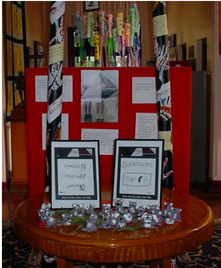
Artwork and stories explaining Reconciliation Day decorate the foyer of Ainslie Primary School

Initiatives to date include action research with the staff of a primary school to identify their needs in supporting the learning of Indigenous students, in order to assist with the development and delivery of strategies that will impact on outcomes for Indigenous students throughout their years of primary school education.