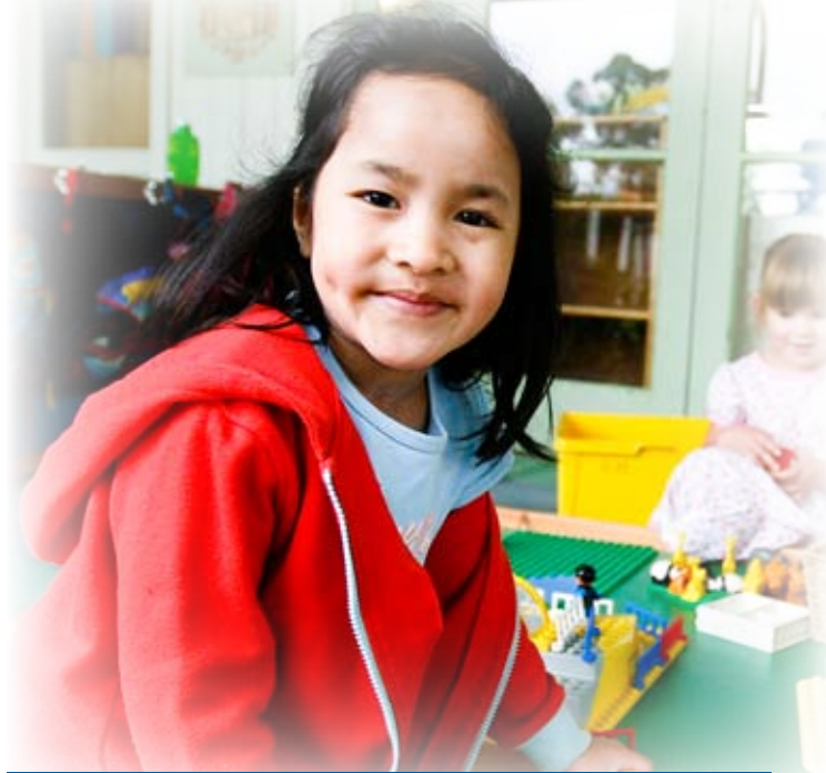
Map showing location of school

The school is also taking names and contact details of people who are interested in the child care program. These names will be passed on to the provider of the service once they are known.